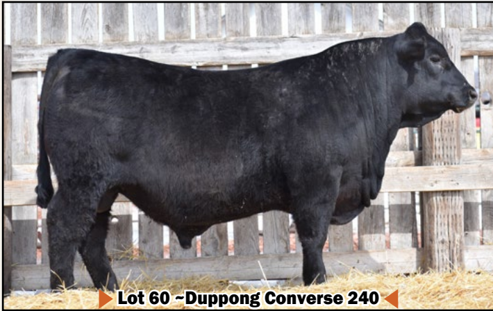
Lot 60 - Duppong Converse 240