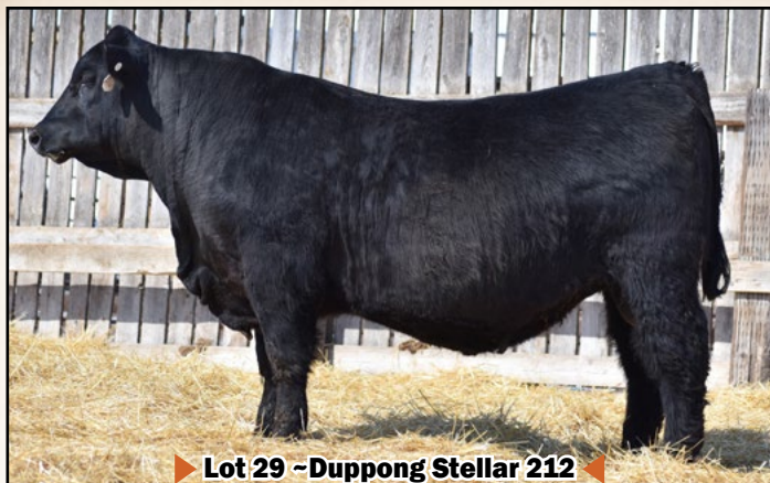
▶ Lot 29 ~Duppong Stellar 212 ◀