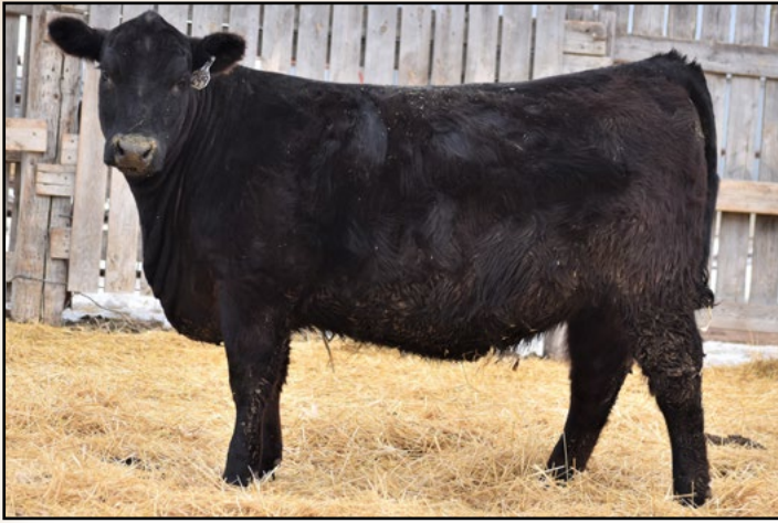
▶ Lot 107 ~ Duppong Blackette Airy 249 ◀