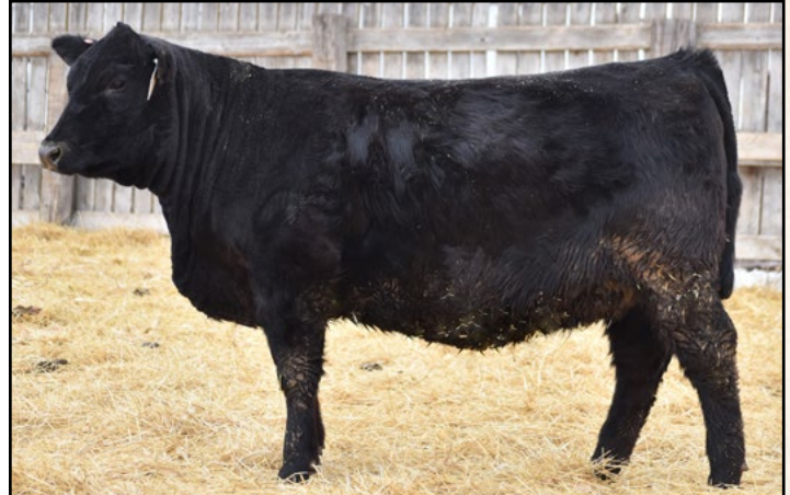
▶ Lot 109 ~ Duppong Flora 2186 ◀