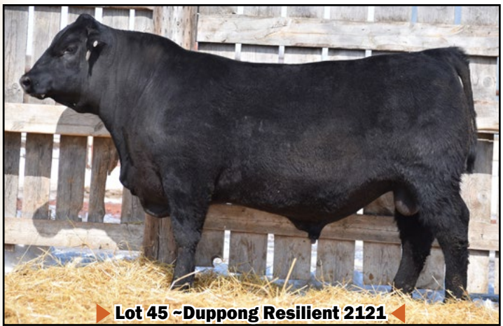
▶▶ Lot 45 - Duppong Resilient 2121 ◀◀