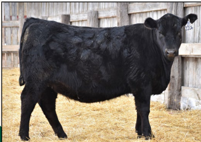
▶ Lot 110 ~ Duppong Eisa Erica 2206 ◀