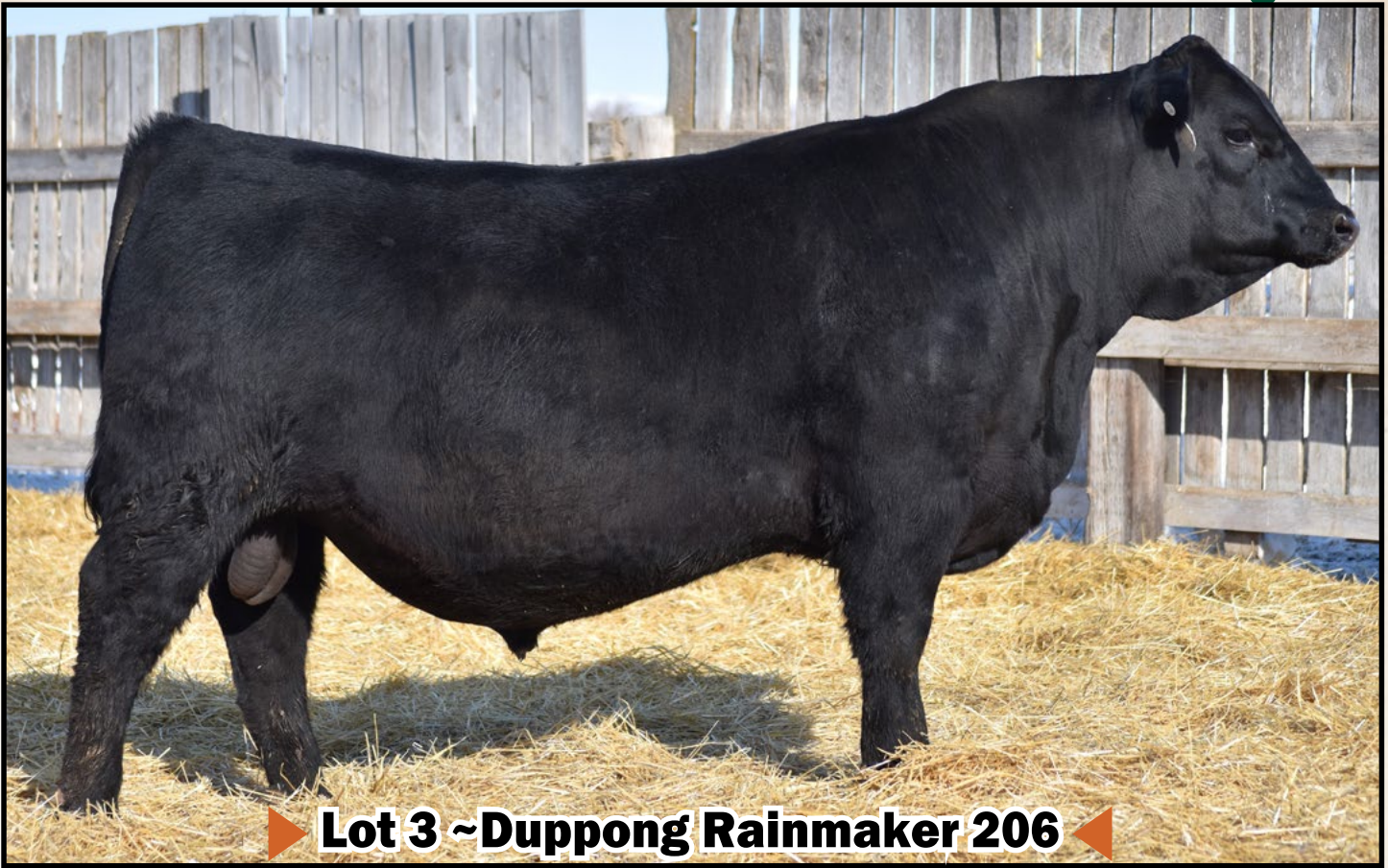
▶ Lot 3 ~ Duppong Rainmaker 206 ◀