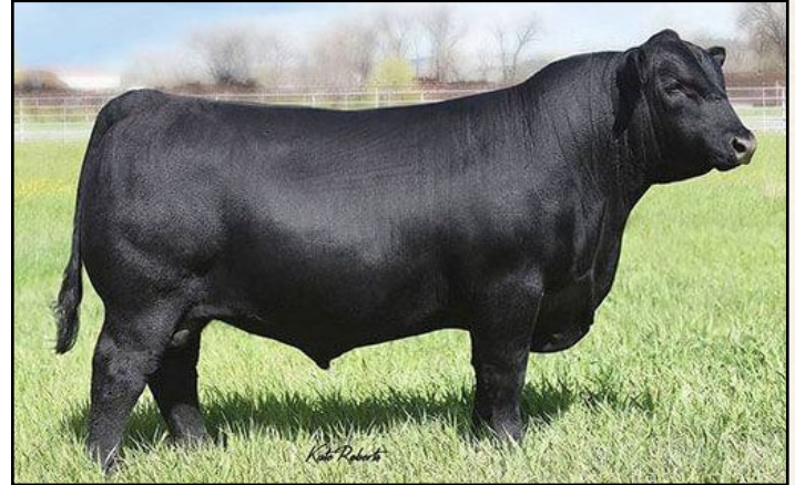
Musgrave 316 Stunner • Full brother to Lots 12 and 13