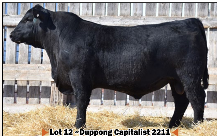
Lot 12 - Duppong Capitalist 2211