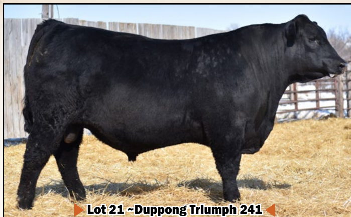
▶ Lot 21 - Duppong Triumph 241 ◀