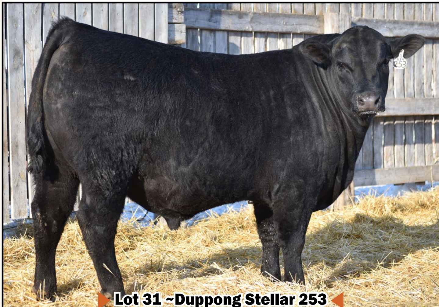
▶ Lot 31 ~Duppong Stellar 253 ◀