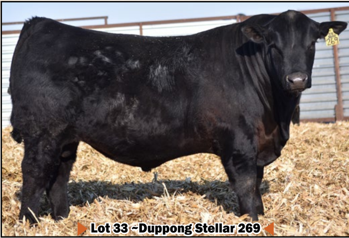
▶ Lot 33 - Duppong Stellar 269 ◀