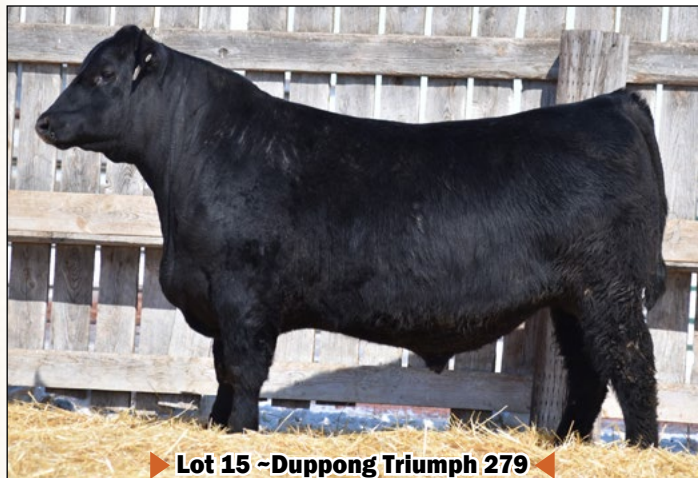
Lot 15 ~ Duppong Triumph 279