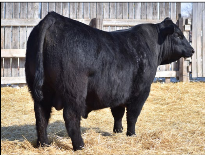
Lot 82 • Duppong Stunner 276