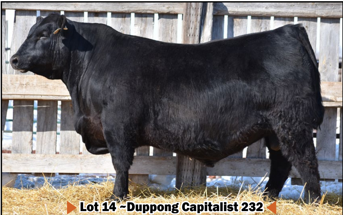
▶ Lot 14 ~ Duppong Capitalist 232 ◀