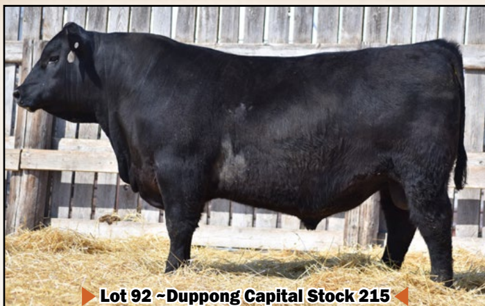
▶ Lot 92 - Duppong Capital Stock 215 ◀