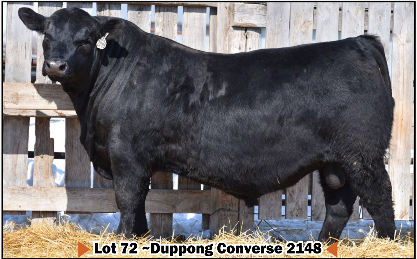
Lot 72 ~ Duppong Converse 2148