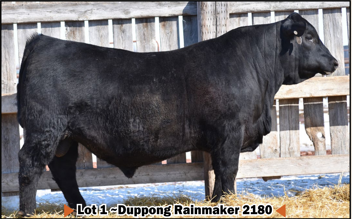
▶ Lot 1 ~ Duppong Rainmaker 2180 ◀