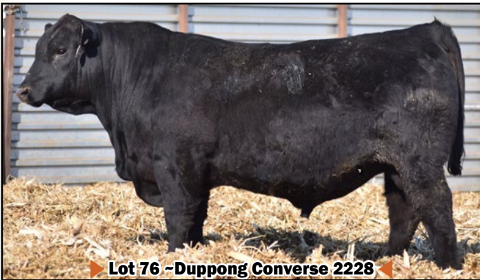
▶ Lot 76 - Duppong Converse 2228 ◀