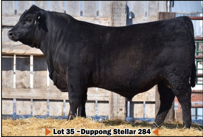
▶ Lot 35 - Duppong Stellar 284 ◀