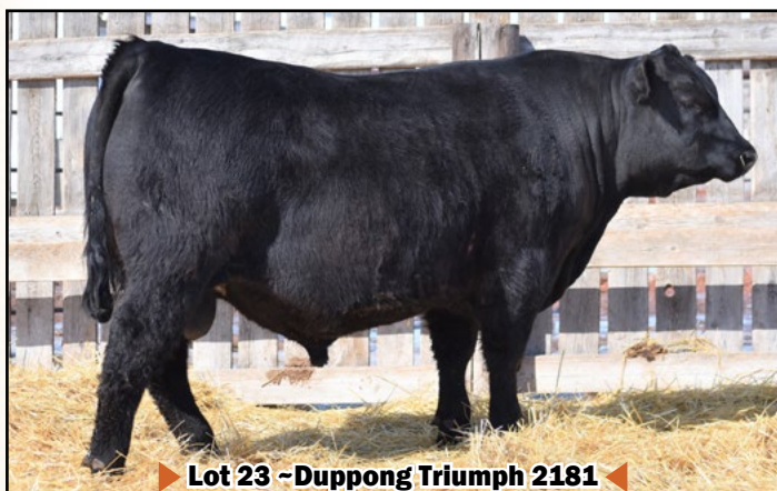
▶ Lot 23 - Duppong Triumph 2181 ◀