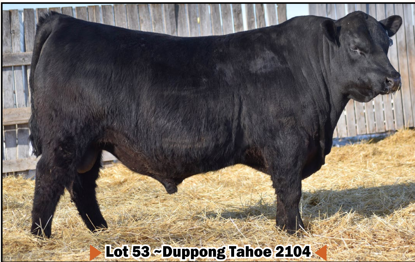
▶ Lot 53 ~ Duppong Tahoe 2104 ◀