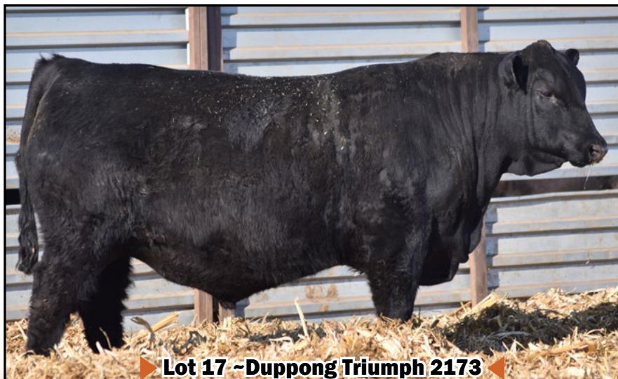
Lot 17 ~ Duppong Triumph 2173