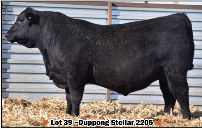
▶ Lot 39 - Duppong Stellar 2205 ◀