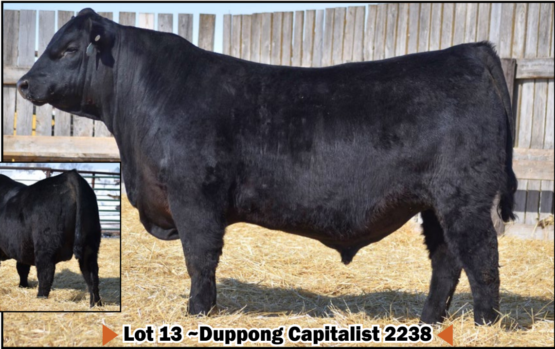
▶ Lot 13 ~ Duppong Capitalist 2238 ◀