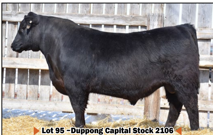
▶ Lot 95 - Duppong Capital Stock 2106 ◀