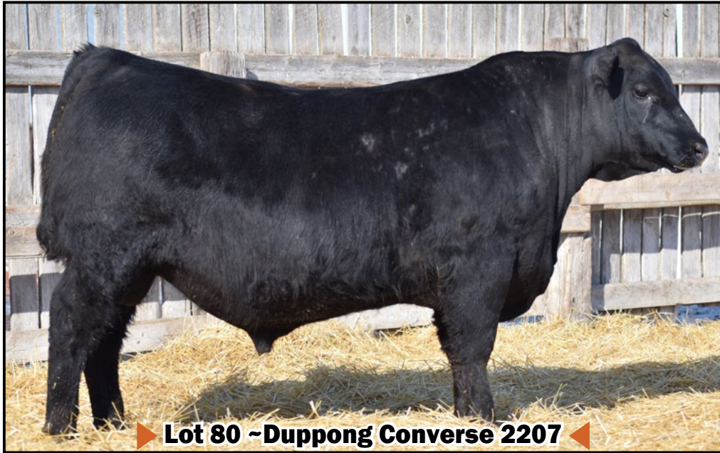
▶ Lot 80 ~ Duppong Converse 2207 ◀