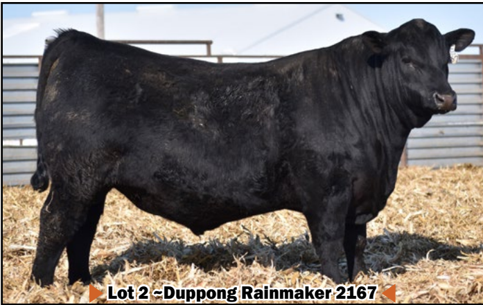
▶ Lot 2 ~ Duppong Rainmaker 2167 ◀