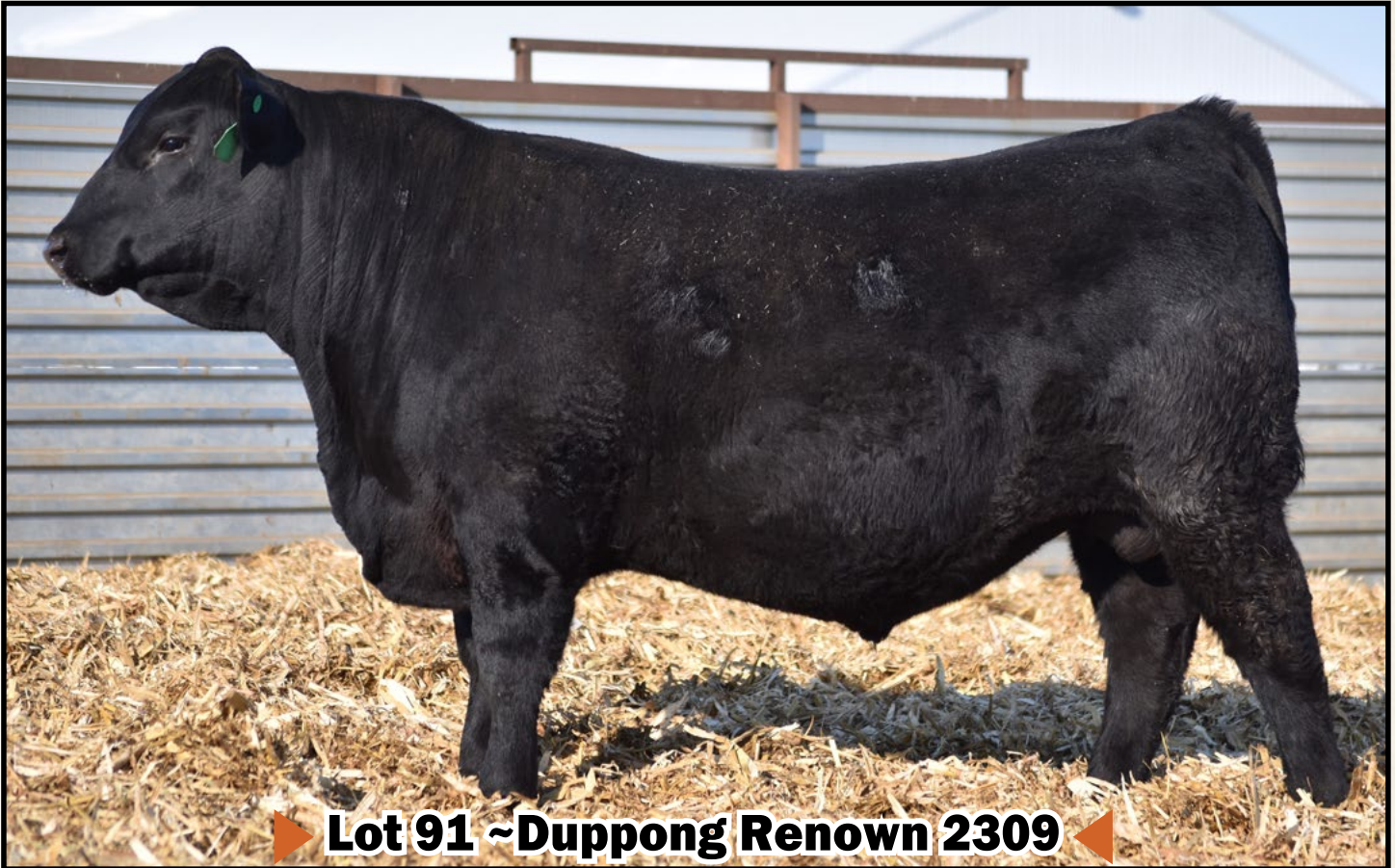
▶ Lot 91 ~ Duppong Renown 2309 ◀